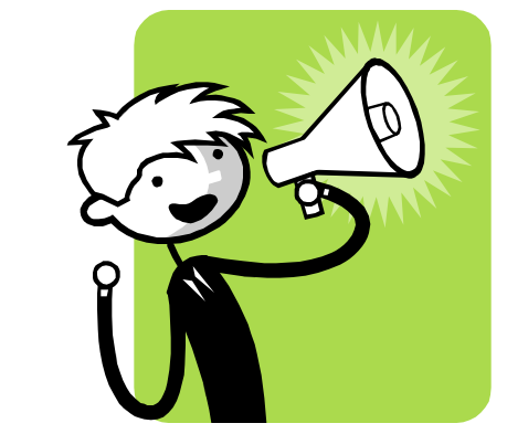
MORTGAGE FOLKS PLEASE READ ALL TRANSITION ARTICLES! THERE IS CRITICAL INFORMATION THAT WILL DIRECTLY AFFECT YOUR LICENSE!